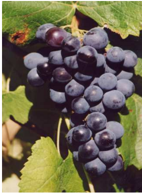
N.Y- Muskat (A)