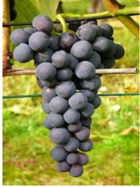
Venus (A) sans pépins