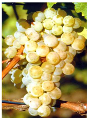
Ferdinand de Lesseps