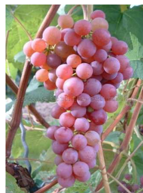
Sulima sans pépins