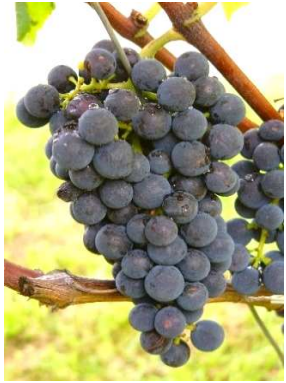
Buffalo,(A) = Americano