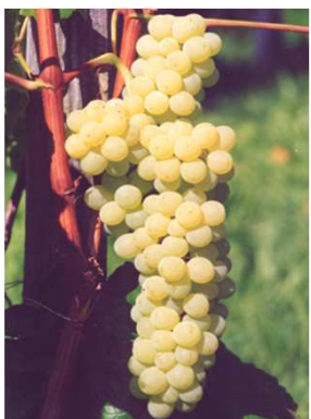
Romulus et New York sans pépins