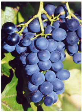
Muscat bleu, Garnier