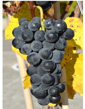
Dirju Campbell early (A)