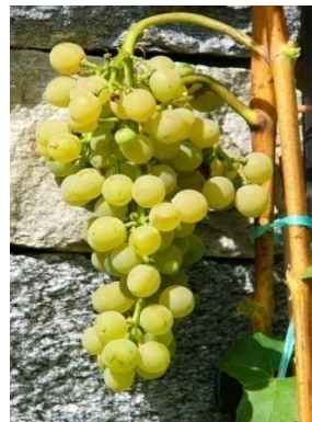
Muscat de la Birse (S)