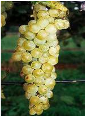
Himrod sans pépins